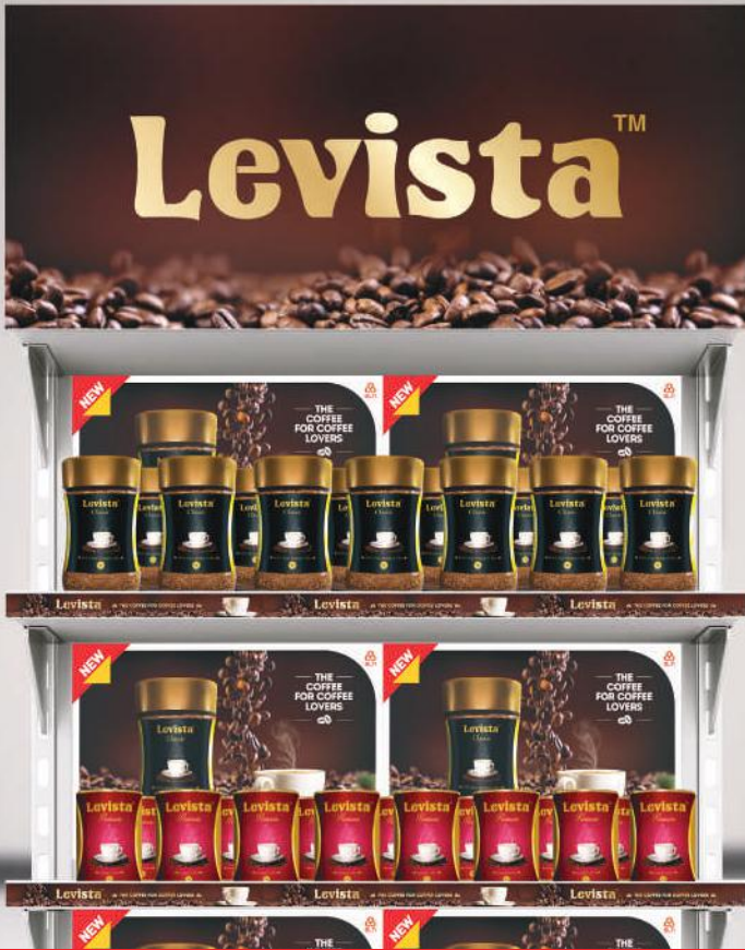
Rack Branding with Shelf Strips & Gandola Header