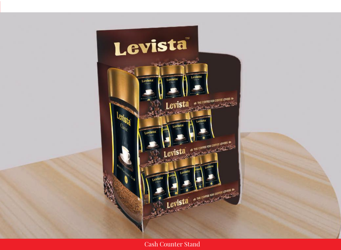
Cash Counter Stand