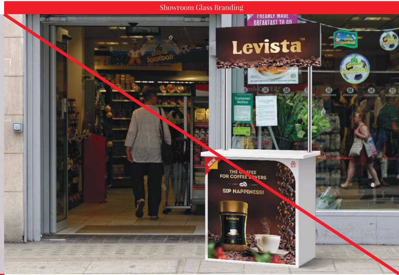
Showroom Glass Branding